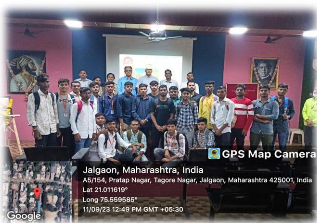
With the guest speaker and teacher and students.