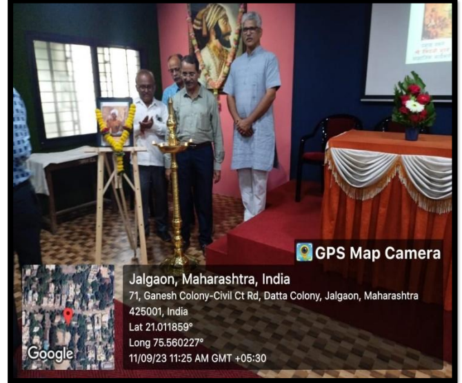
Chief guest & Principle sir lighting the lamp