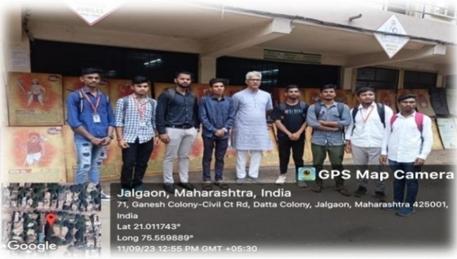
Students from the department of history along with Guest Surange Sir in he poster exhibition.