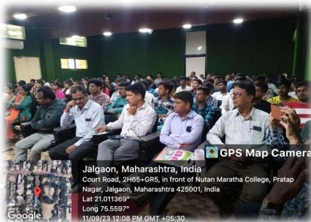
Teachers presented in the Programme hall