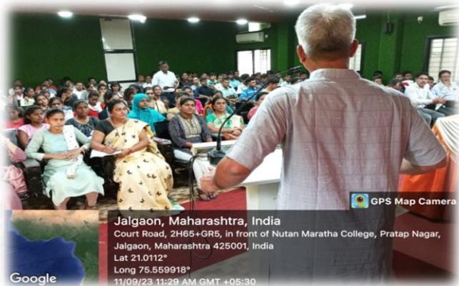
Surange sir expressed his views in the programme