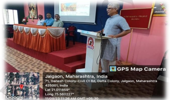
Surange sir expressed his views in the programme.