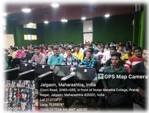
Students presented in the Programme hall