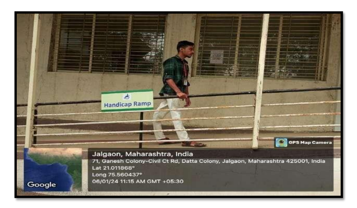
Ramps made available to approach Principal office and Administrative office