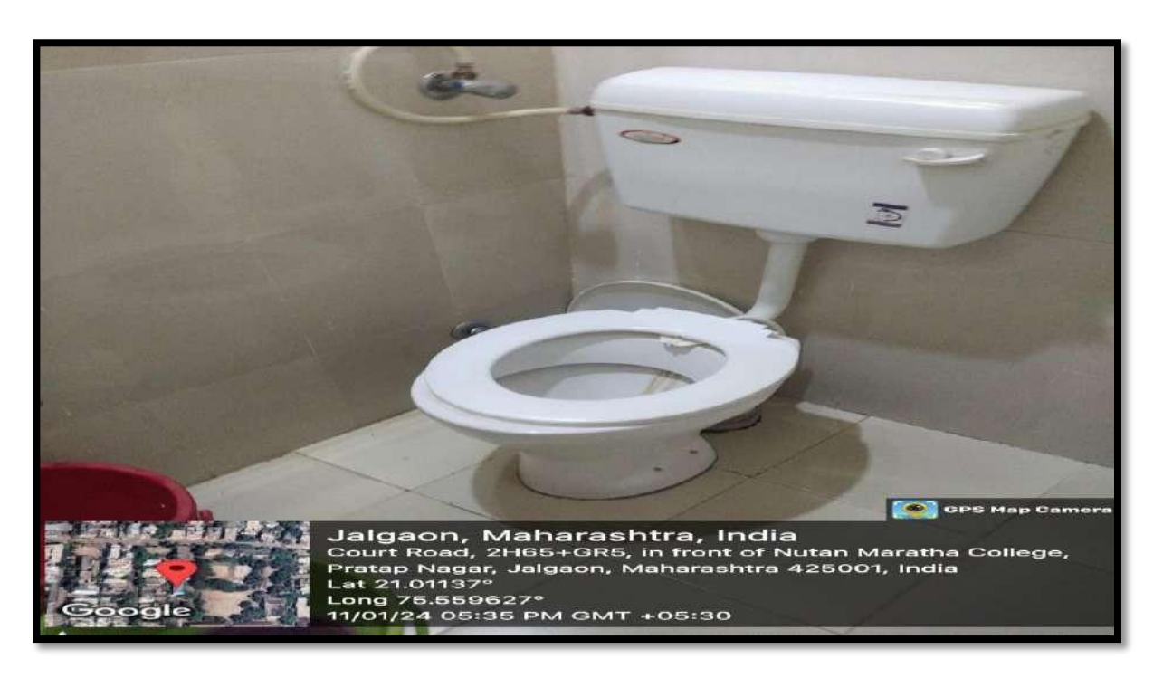
Washrooms to Divyagjan