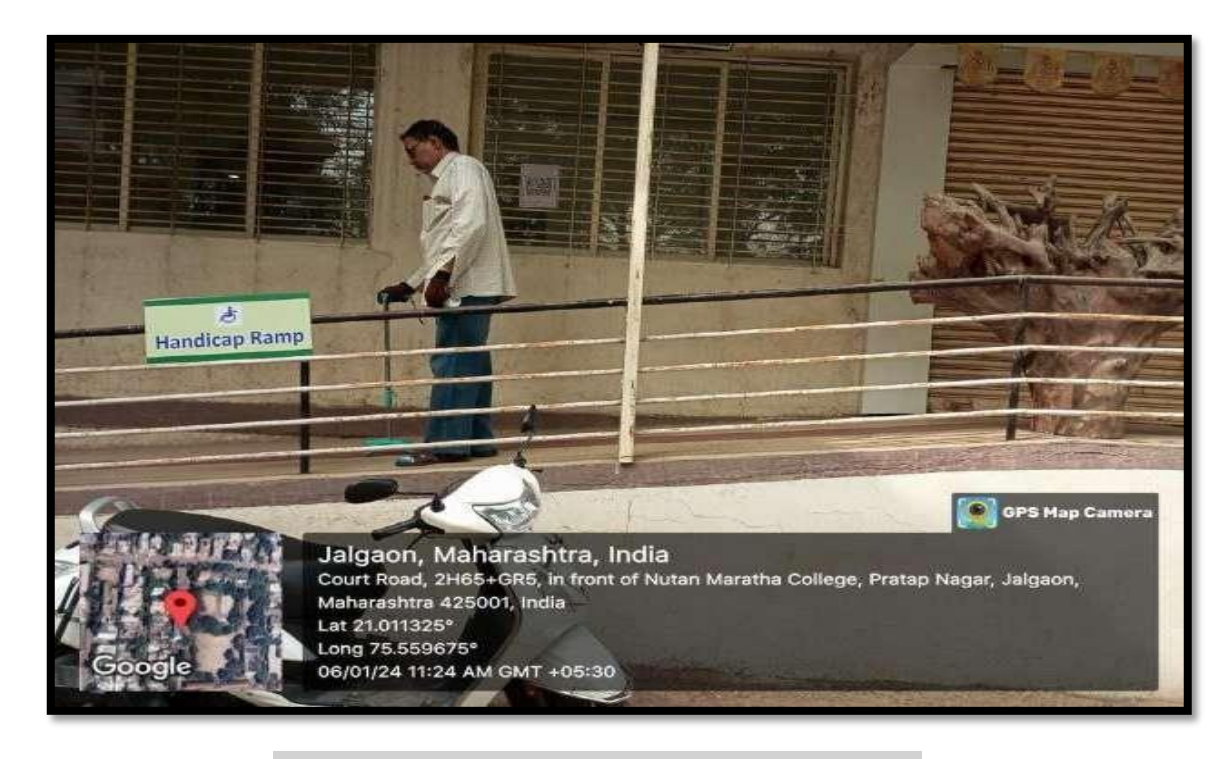
Ramps made available to Administrative office