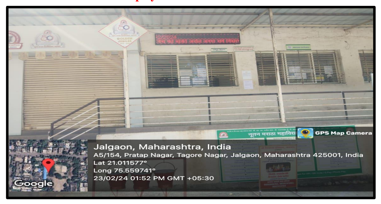
Electronics Notice Display Board