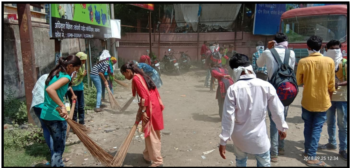
“Swachhata hi Seva” at new bus stand, Jalgaon 25/09/201