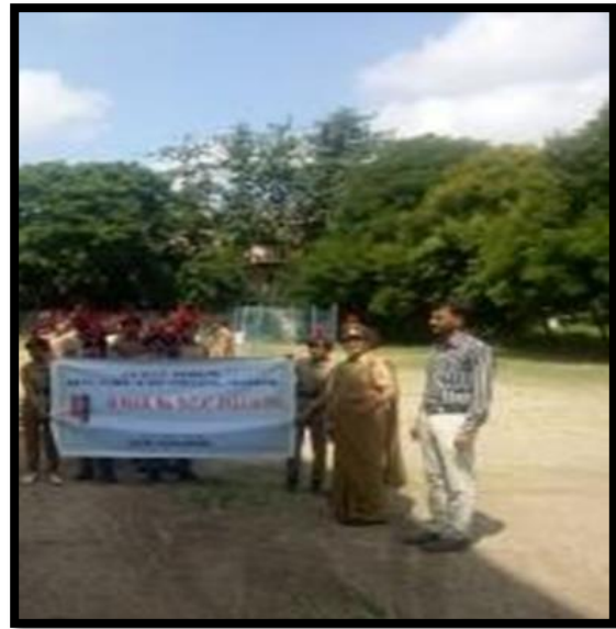
Cleaned college campus and Rally