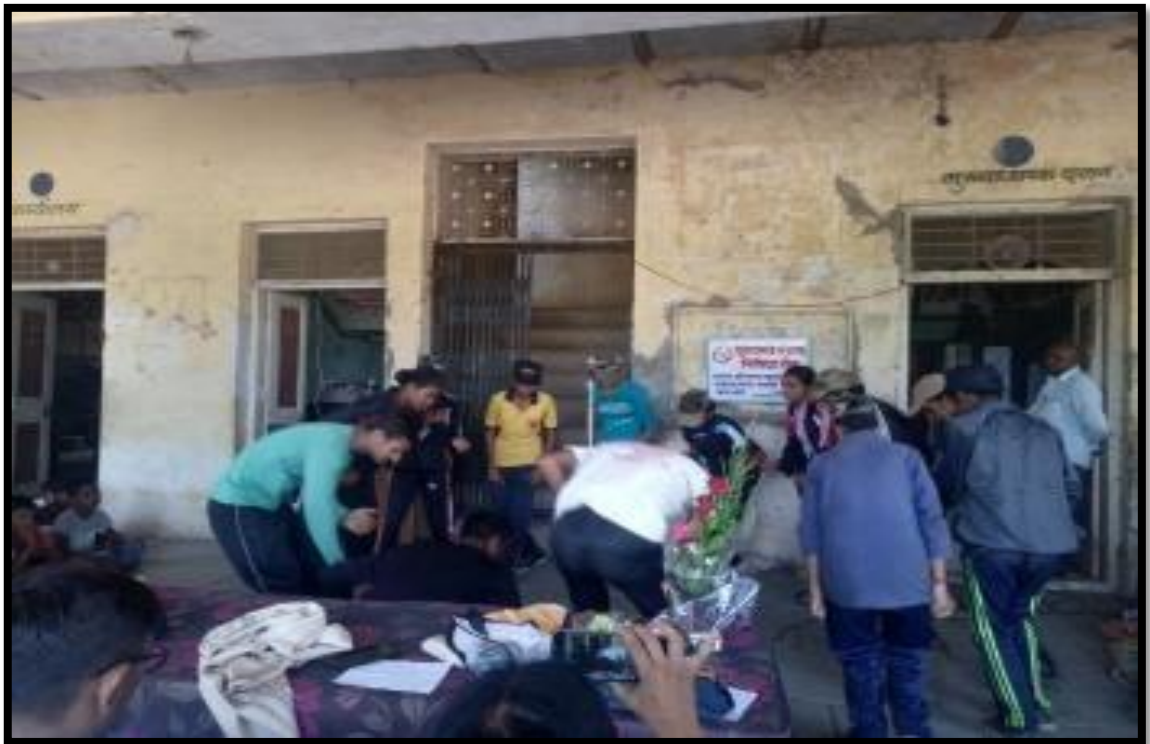
Street Play 26/09/2018