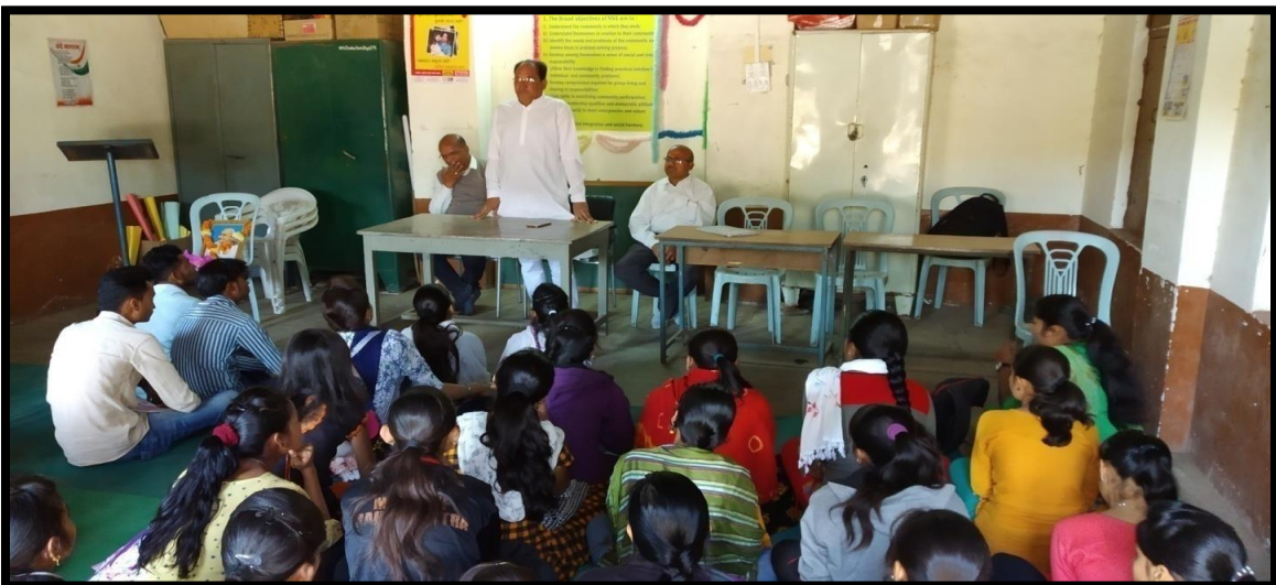
Lecture Organized On Occasion of Mahatma Gandhi Jayanti