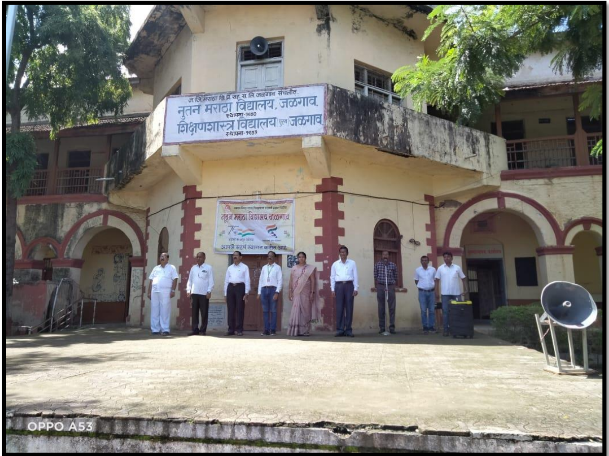
01/05/2019 Flag hosting on the occasion of Maharashtra Day