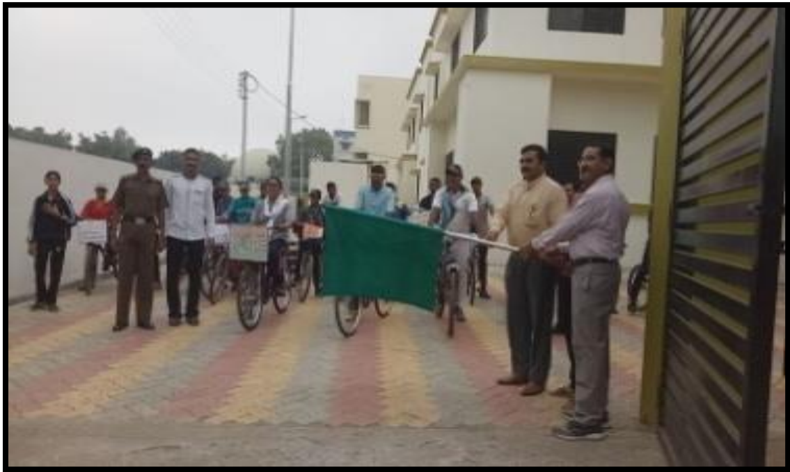
A Cycle Rally ( from Jalgaon to Kanalda 19 Km