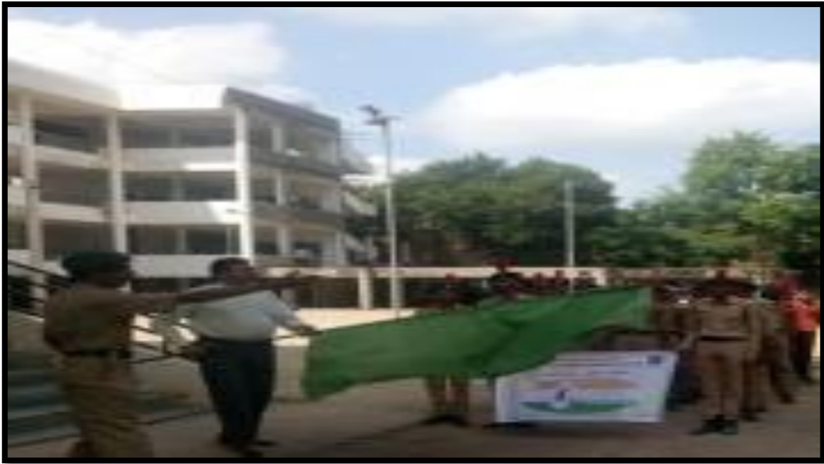
30 Cadets participated in a rally in the city on “cleanliness drive

30 Cadets participated in a rally in the city on “cleanliness drive” under SWACHH BHARAT ABHIYAN from Baheti College, Jalgaon to N.M.College on 27/08/2018.