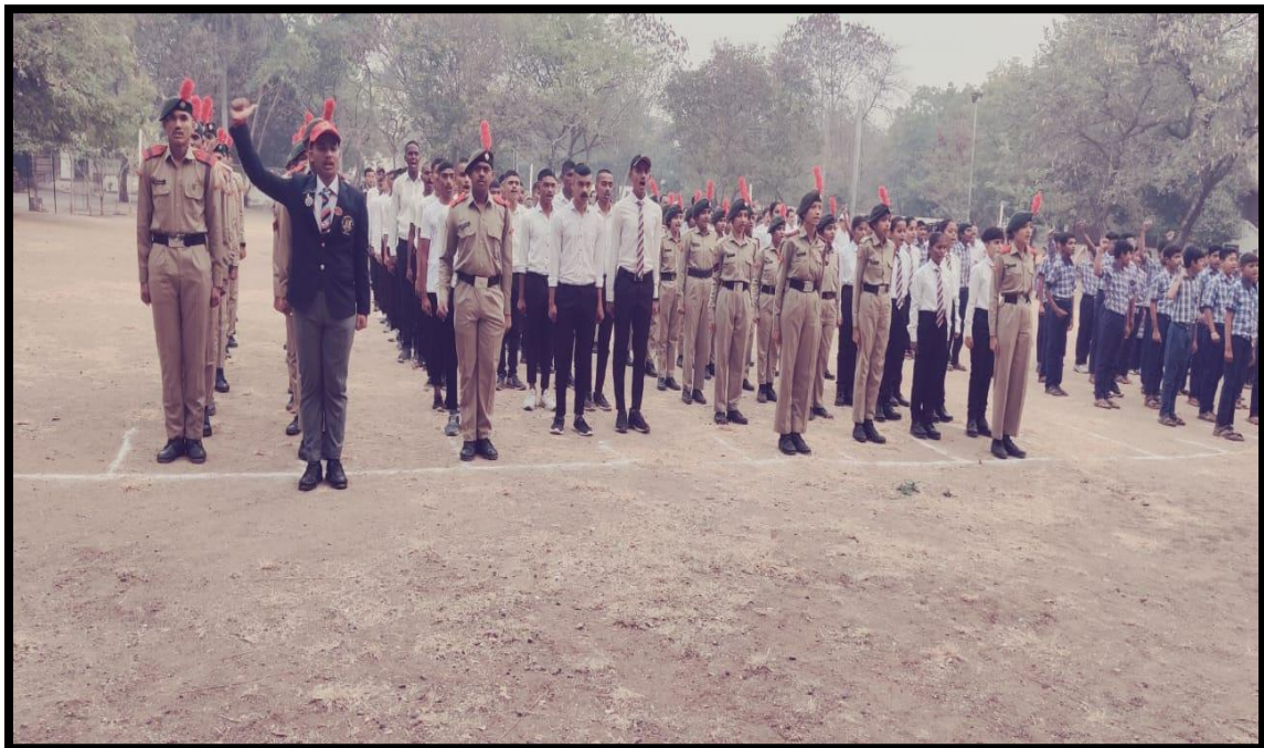
Flag hosting on the occasion of Independence Day 15/08/2018