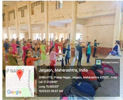
Self defense training