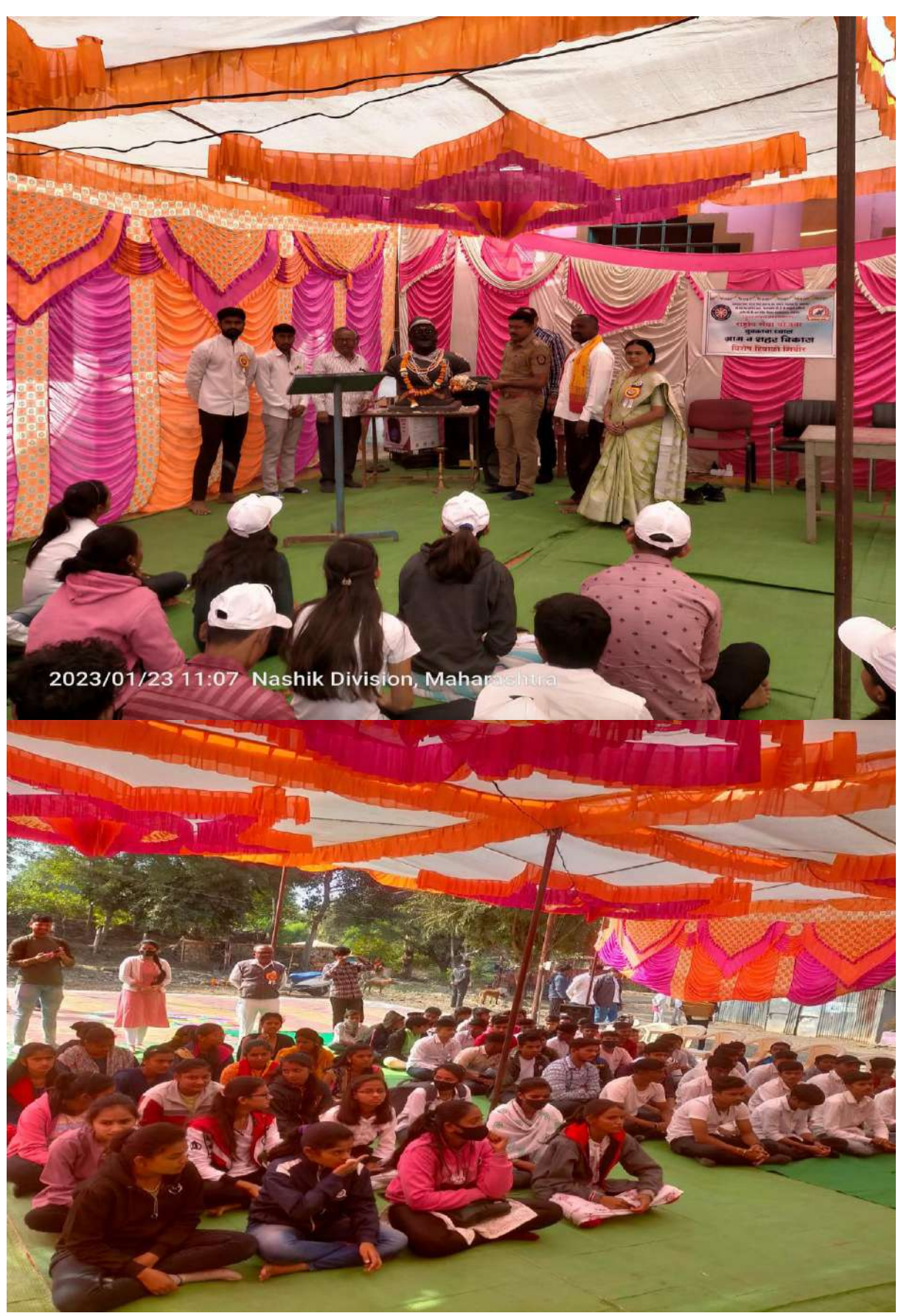
NSS Unit Special Winter Camp at Umala Ta Dist Jalgaon Date 17/01/2023 to 23/01/2023