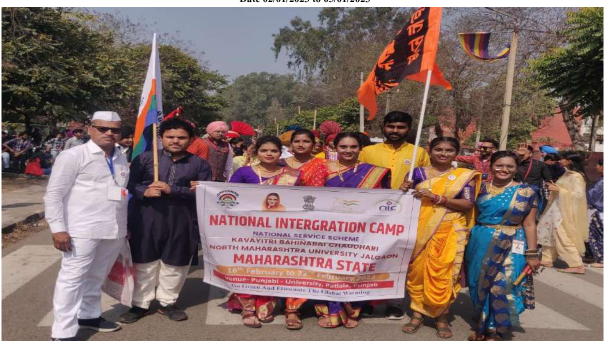
Date 02/01/2023 to 05/01/2023