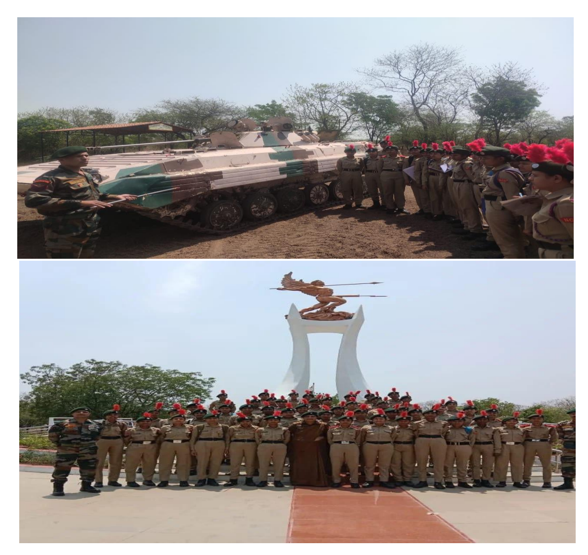
Army attachment camp Pooja patil and divya nikam