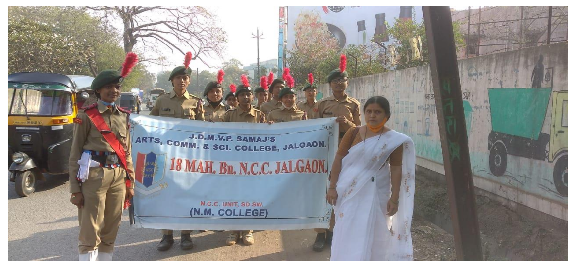
Cleanliness Rally- NCC Cadets participant