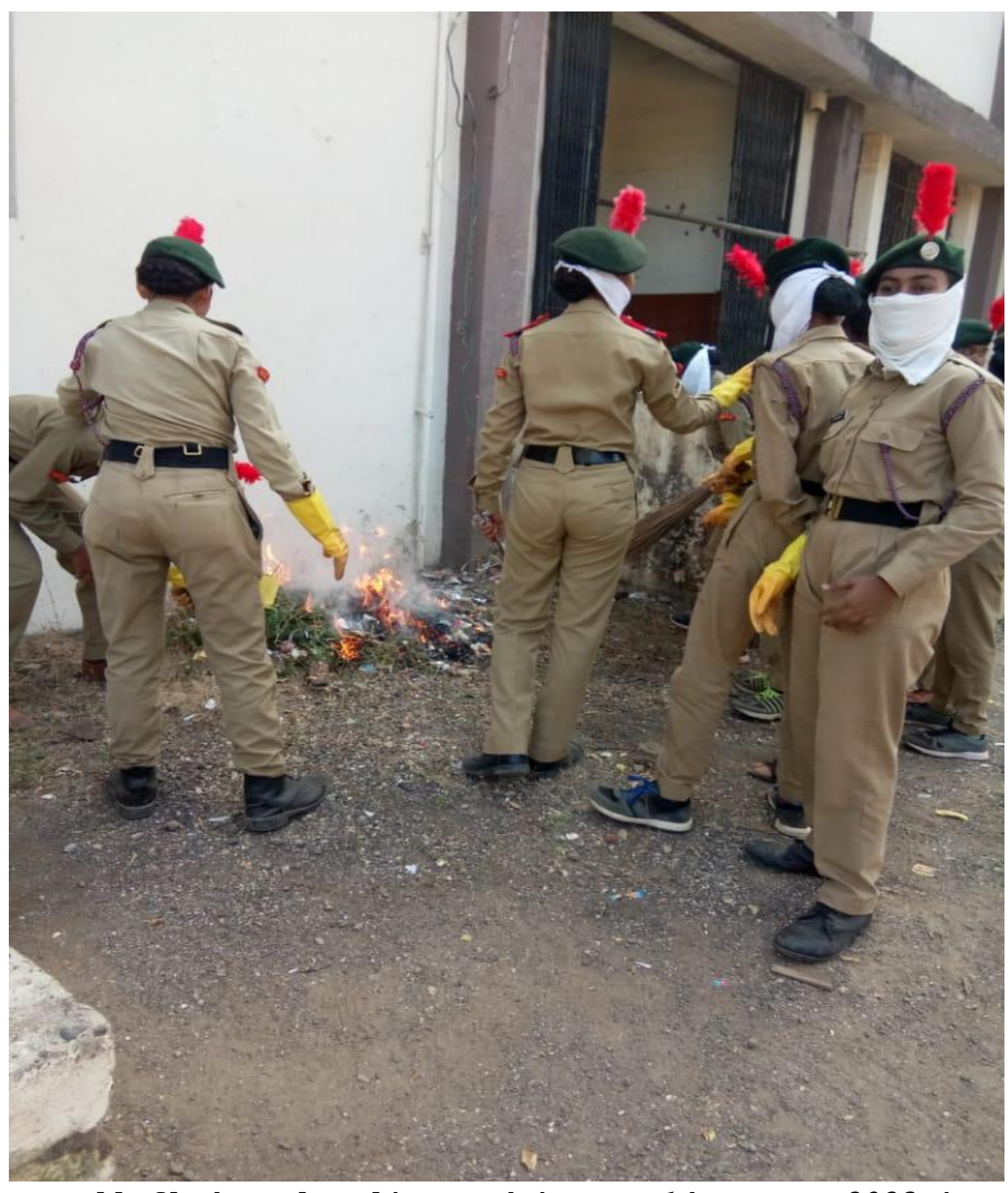
Full fledge Cleanliness drive on 14 August 2023 in NM college

On the eve of Independence Day the college building and its surroundings were cleaned thoroughly. Around 55 cadets and NSS helpers participated.