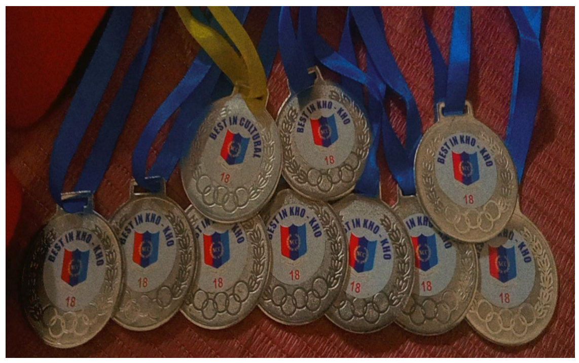
KHO KHO WINNER TEAM