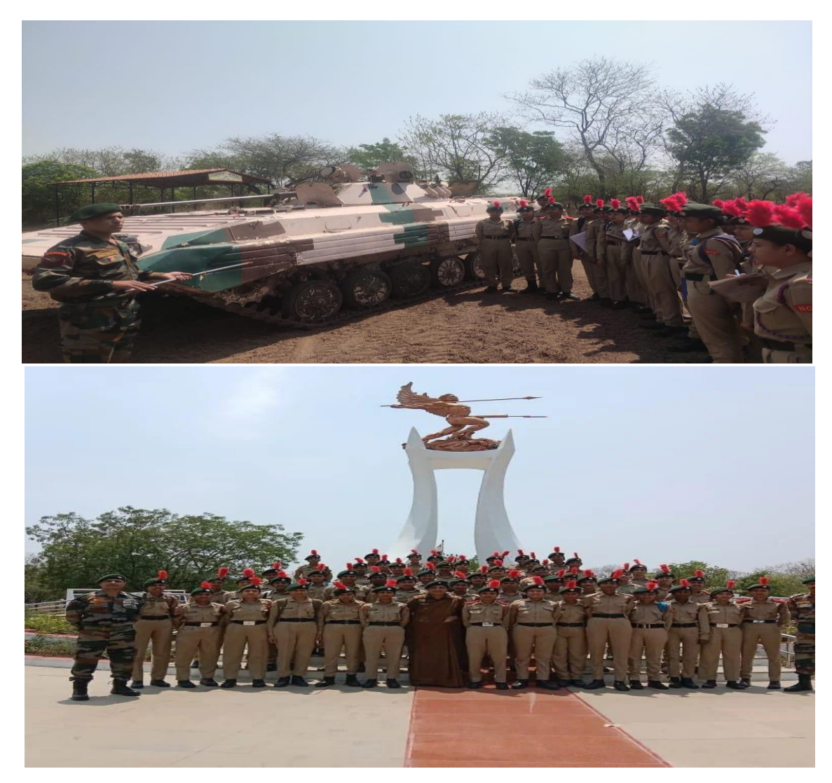
Army attachment camp Pooja patil and divya nikam