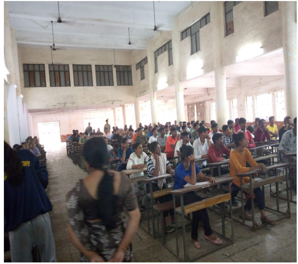
PI staff conducting written exams in NCC camp 2022-23

Major Komalsingh guided the students and gave information on the Indian army. In this test 175 students participated. They were judged on basis of their height, weight and performance in written exams and finally 30 were selected.