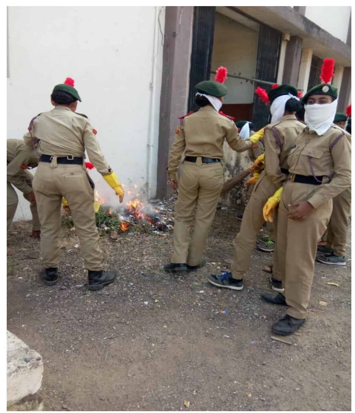
Full fledge Cleanliness drive on 14 August 2023 in NM college

On the eve of Independence Day the college building and its surroundings were cleaned thoroughly. Around 55 cadets and NSS helpers participated.