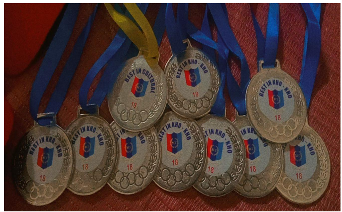
KHO KHO WINNER TEAM