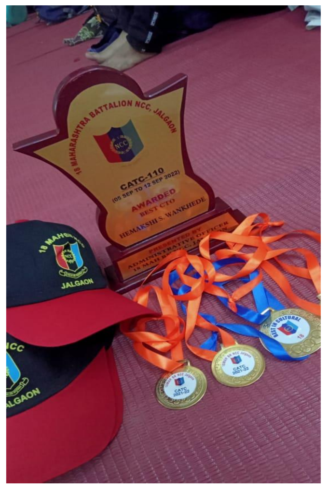
BEST CTO HEMAKSHI WANKHEDE