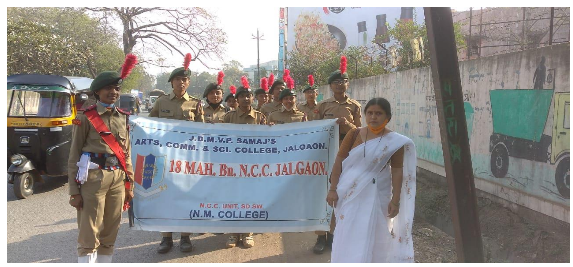
Cleanliness Rally- NCC Cadets participant