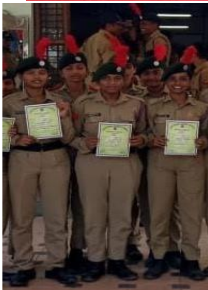
Basic Leadership campaign held at Amaravati