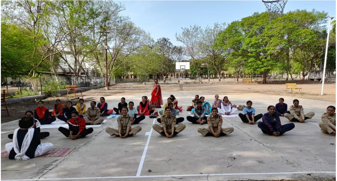
NCC cadets and Trainers giving training