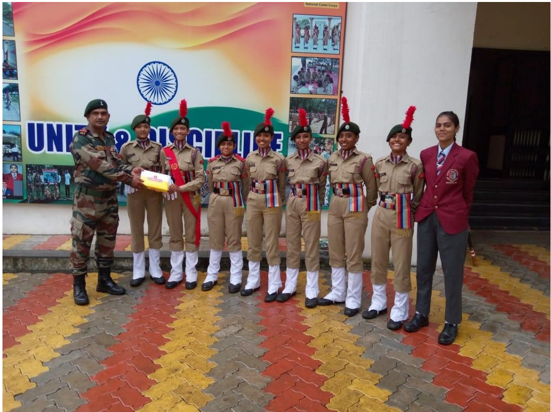
SW cadets giving guard of honour to NCC cadets on 15 August 2021