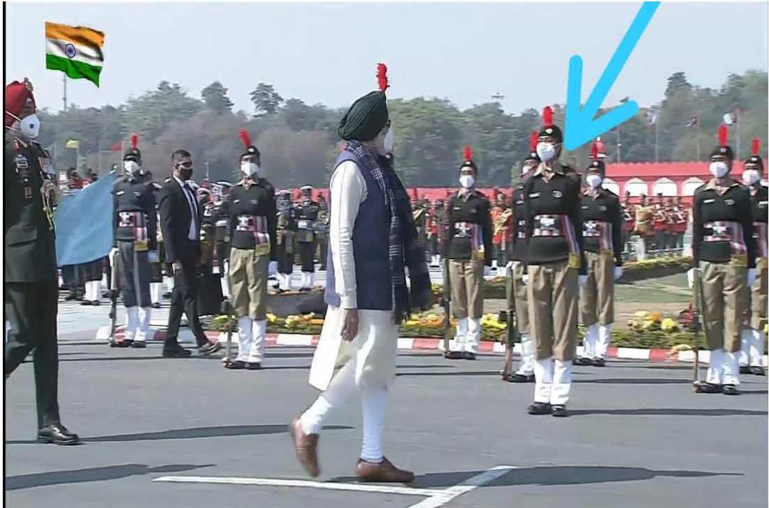
SUO Sonali Patil giving guard of honour to prime minister SHRI. NARENDRA MODI and DG NCC LIEUTENANT GURBEERPAL SINGH at Rajpath, NEW DELHI