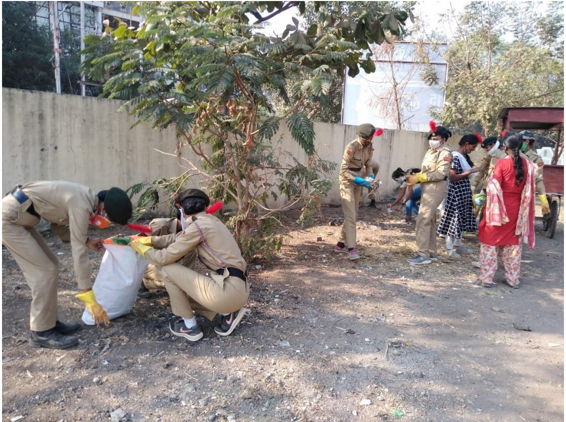
Full fledged Cleanliness drive on 14 August 2021 in NM college