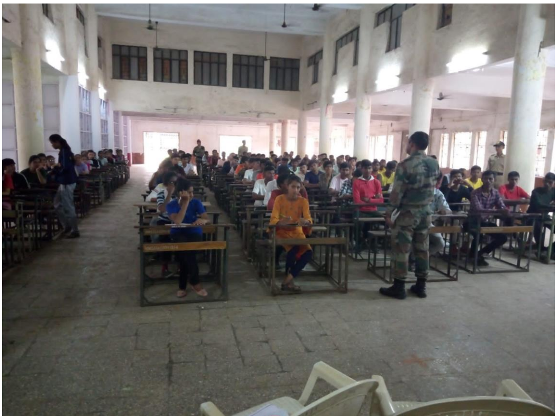
PI staff conducting written exams in NCC camp 2021-22

Major Komalsingh guided the students and gave information on the Indian army. In this test 150 students participated. They were judged on basis of their height, weight and performance in written exams and finally 32 were selected.