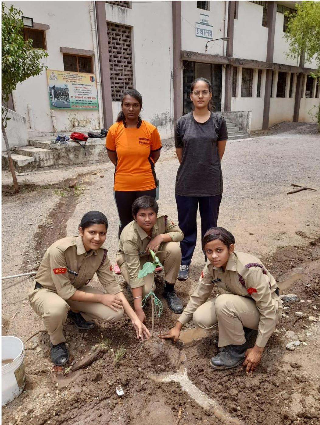
Tree plantation drive on WORLD ENVIRONMENT DAY