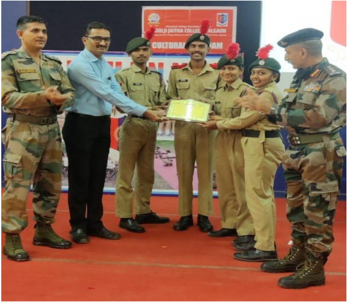
❖ 'Ek Bharat Shreshth Bharat' campaign at Bhubaneswar