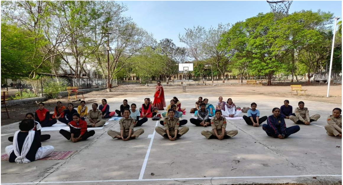
1NCC cadets and Trainers giving training