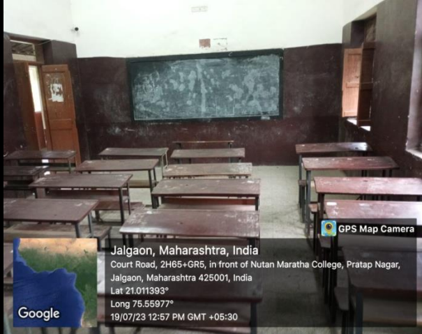
Jalgaon, Maharashtra, India Court Road, 2H65+GR5, in front of Nutan Maratha College, Pratap Nagar, Jalgaon, Maharashtra 425001, India Lat 21.011393° Long 75.55977° 19/07/23 12:57 PM GMT +05:30