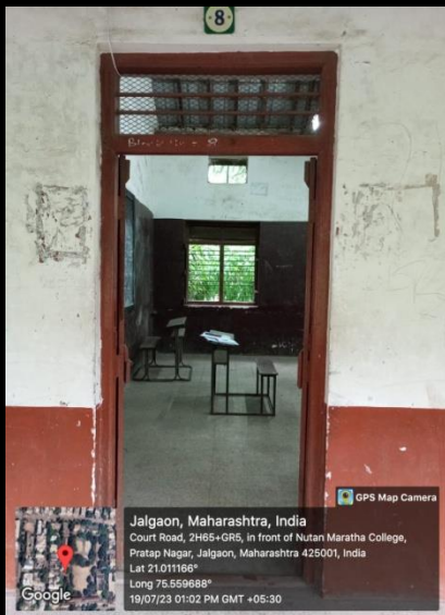
Jalgaon, Maharashtra, India Court Road, 2H65+GR5, in front of Nutan Maratha College, Pratap Nagar, Jalgaon, Maharashtra 425001, India Lat 21.011166° Long 75.559888° 19/07/23 01:02 PM GMT +05:30