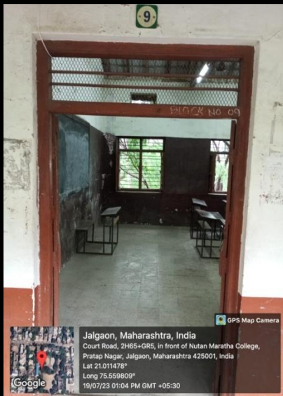
Jalgaon, Maharashtra, India Court Road, 2H65+GR5, in front of Nutan Maratha College, Pratap Nagar, Jalgaon, Maharashtra 425001, India Lat 21.011478° Long 75.559809° 19/07/23 01:04 PM GMT +05:30