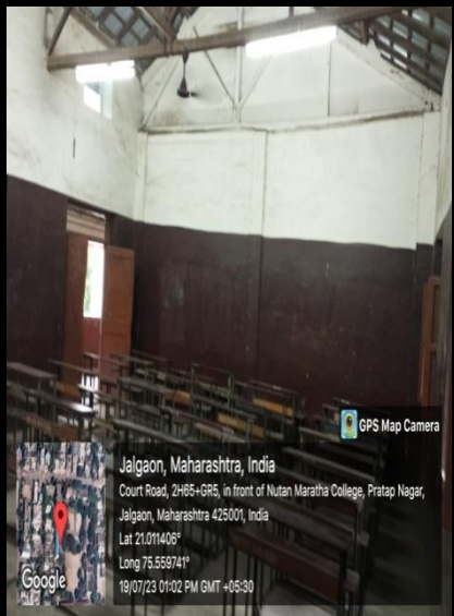
Jalgaon, Maharashtra, India Court Road, 2H65+GR5, in front of Nutan Maratha College, Pratap Nagar, Jalgaon, Maharashtra 425001, India Lat 21.011408° Long 75.559741° 19/07/23 01:02 PM GMT +05:30