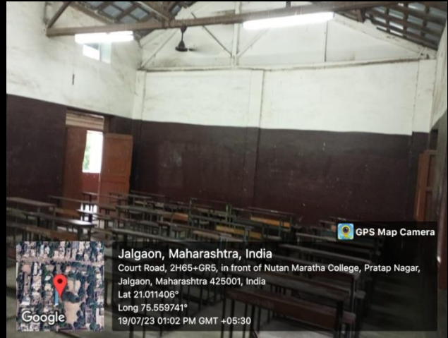
Jalgaon, Maharashtra, India Court Road, 2H65+GR5, in front of Nutan Maratha College, Pratap Nagar, Jalgaon, Maharashtra 425001, India Lat 21.011408° Long 75.559741° 19/07/23 01:02 PM GMT +05:30